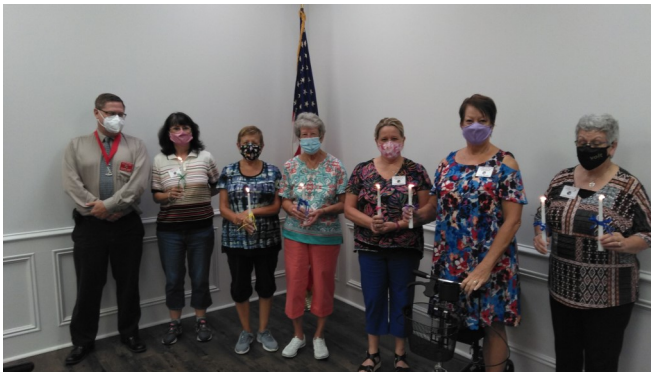
Shown above is the Installation for our Ladies Auxiliary